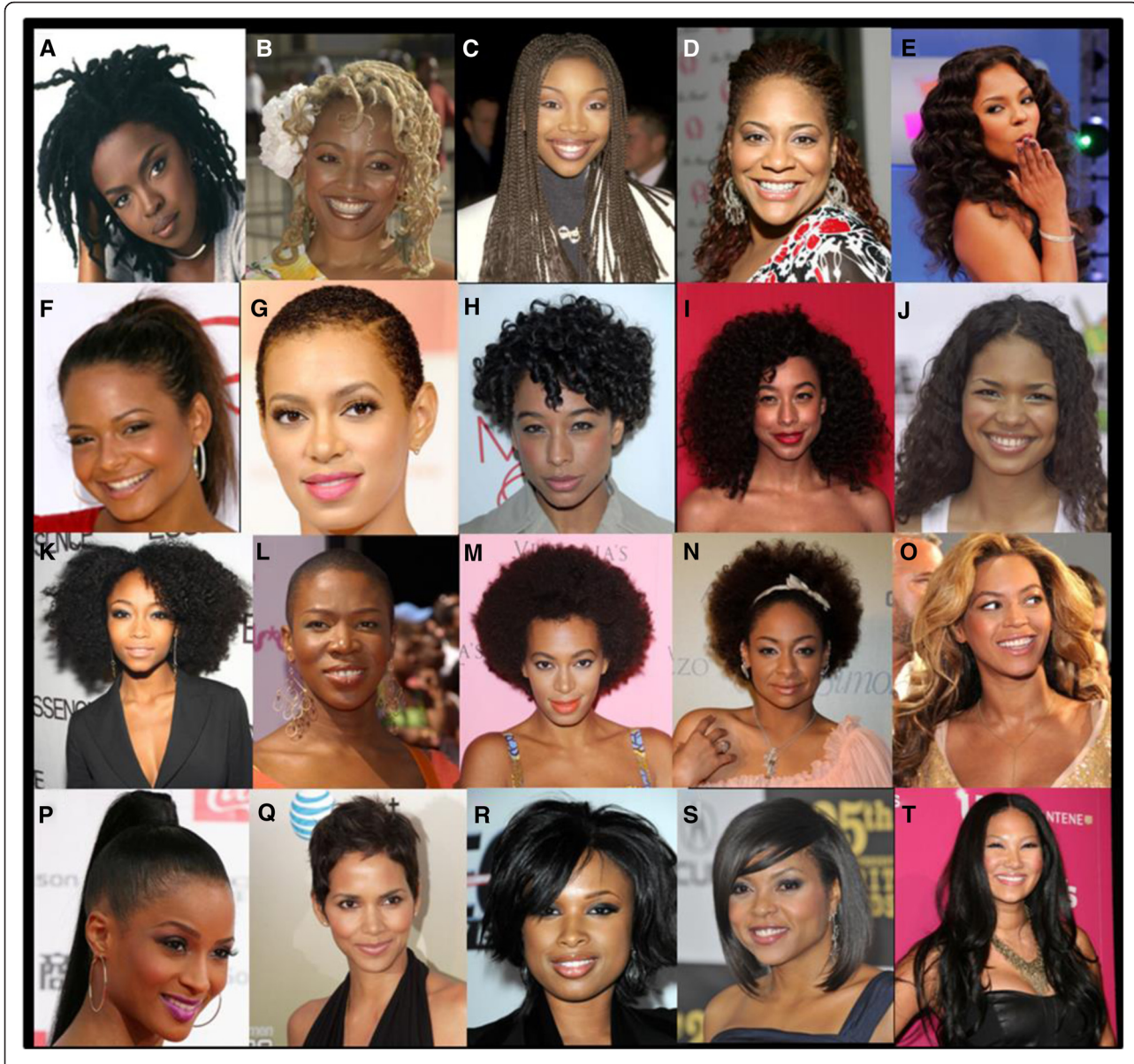
Fig. 1 Photo Array of Hairstyles.

responses to the MEIM. Mean ethnic identity scores were calculated for each location. Mean days of physical activity per week was calculated as described above. Linear regression (stratified by location) was used to examine associations between self-reported physical activity and ethnic identity for girls in each location. Due to the small sample size of the study and due to similarities in both the quantitative and qualitative data from Michigan and California, these were grouped for this analysis.